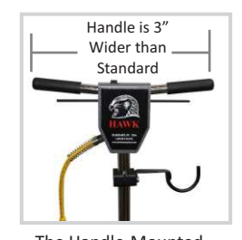
The Handle-Mounted Hose Support Carries 1.5" and 2" Vacuum Hoses