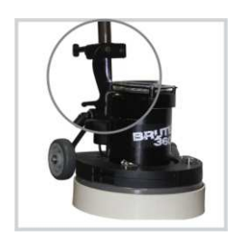
Variable Handle Height Adjustment and Transport Lock